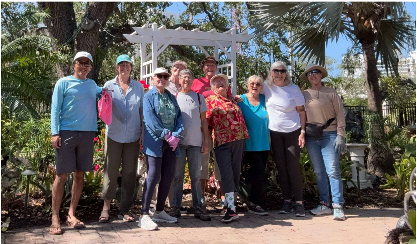
Friday April 25th's volunteers (above), the refurbished waterfall (below)