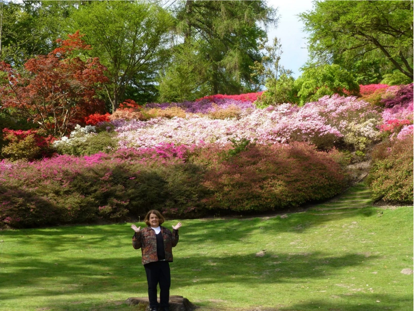
‘The Punch Bowl’ in Windsor Great Park (years ago)

Send me photos of your garden for inclusion in Blooming Chatter – I’ll send some from England!