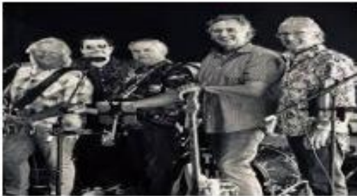
"The Klick Band"

Enjoy music from the 50's to present while sitting in a beautiful garden setting or strolling through the beautiful gardens which are maintained by the members and The Bay.