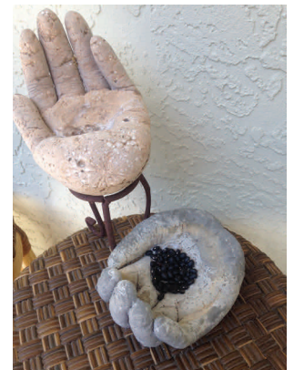
Nancy's hypertufa hands

On August 20th at 9:30 am at SGC; Nancy Abramson will hold a Hypertufa workshop. We will be making a hand similar to the ones she makes for her own garden. We are asking for a $5.00 fee per person to pay for the materials needed. You also will need to bring a 5-6" clay or plastic pot to put your completed hand in to dry. Feel free to bring a bag lunch and your own drink. The kitchen will not be available as it is being renovated. Please email me at kayw33@comcast.net to sign up as we need a head count for purchasing materials needed for this project.